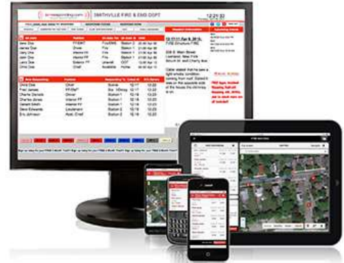
I am Responding

This software provides the 911 Center with a quick and easy way to notify every deputy of a critical call or disaster. The software is also being used for ERT Team call-outs and department staffing needs.