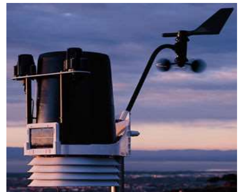
Radio Tower Mounted Weather Station

These devices are specifically designed to provide information such as rainfall amounts, wind speed, wind direction, and barometric pressure. To enhance local weather forecasting, this information will also be shared with the NWS and Barron County community members through existing public weather websites such as AccuWeather.com, WUnderground.com, etc.