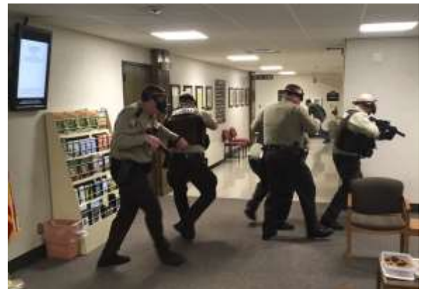
Active Shooter Training – Barron County Gov Center