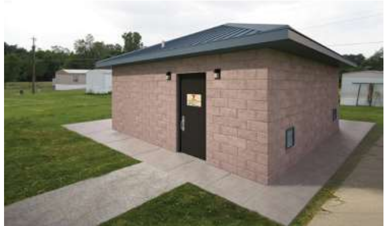
Example of Storm Shelter (not actual design)

The county has also experienced 104 high-wind events since 1993 (averaging 4.5 per year) and resulting in over $5.3 million dollars in damage. In an effort to enhance the physical protection of residents located in mobile home areas, Barron County has applied for a $270,000 FEMA Pre-Disaster Mitigation Grant to fund the construction of two community storm shelters. One located at 1045 22 nd Street in Chetek (Prairie Lake Estates) and one located at 1469 E Division Ave in Barron (East End Estates). The application was sent to FEMA for review in November, however the approval process takes 6-8 months to complete. Additional information to follow as it becomes available.