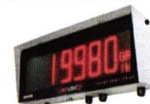
SURVIVOR OTR truck scale LaserLight3

Rice Lake's SURVIVOR OTR truck scale withstands environments with corrosive materials and numerous daily weighments. A reliable, robust truck scale assists the Barron County Waste-to-Energy facility in continuing to produce clean energy and make positive environmental impacts.